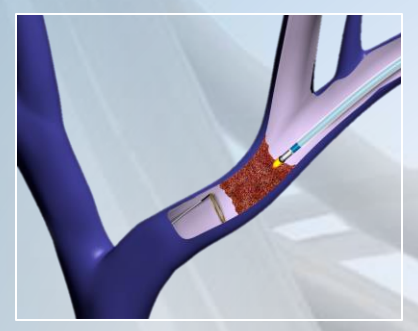
Turn RF energy on to cut into the lesion using a snare as a target.