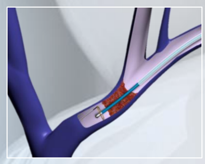
Snare the PowerWire® RF Guidewire.